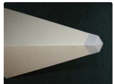
Hybrid absorber, thin-film technology

FRANKONIA IS THE ONLY MANUFACTURER WORLDWIDE WHO PRODUCES NON-COMBUSTIBLE ABSORBERS ACCORDING TO FIRE-CLASS DIN 4102 A2