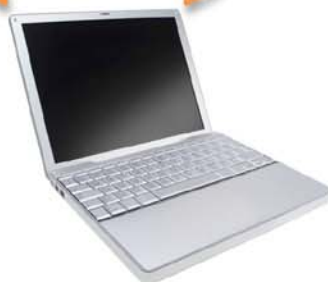
Computer with RS232 /USB Port

Reliant EMC is your top source for test equipment that enables you to reduce cost and time by self testing and certifying your products for Electromagnetic Compliance (EMC)