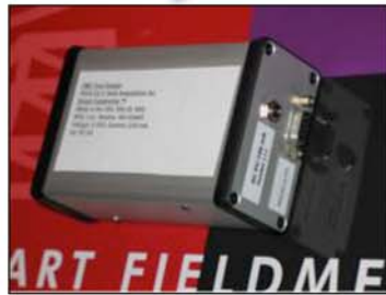
PCLK-01 with Isolated RS232 Port (Requires PC with RS232 Port)