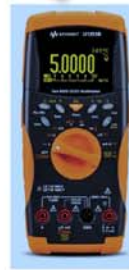
Isolated USB IR Port Multimeter with Isolated USB IR Port