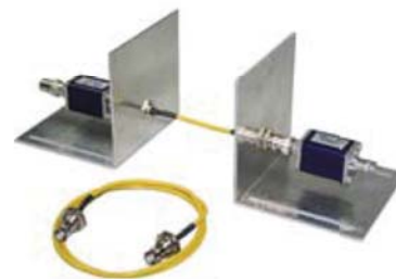
Calibration unit of EMCL (included as standard)