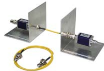
Calibration unit of EMCL (included as standard)