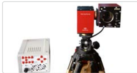
Camera fixed on a tripod for EUT monitoring