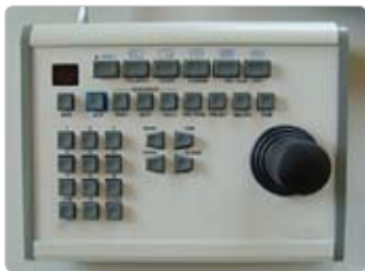
Controller for CCTV and Intercom

Video and audio systems for EUT and / or chamber monitoring including the necessary controllers and feed-throughs for the control lines are available and may be installed as option (see our separate catalogue).